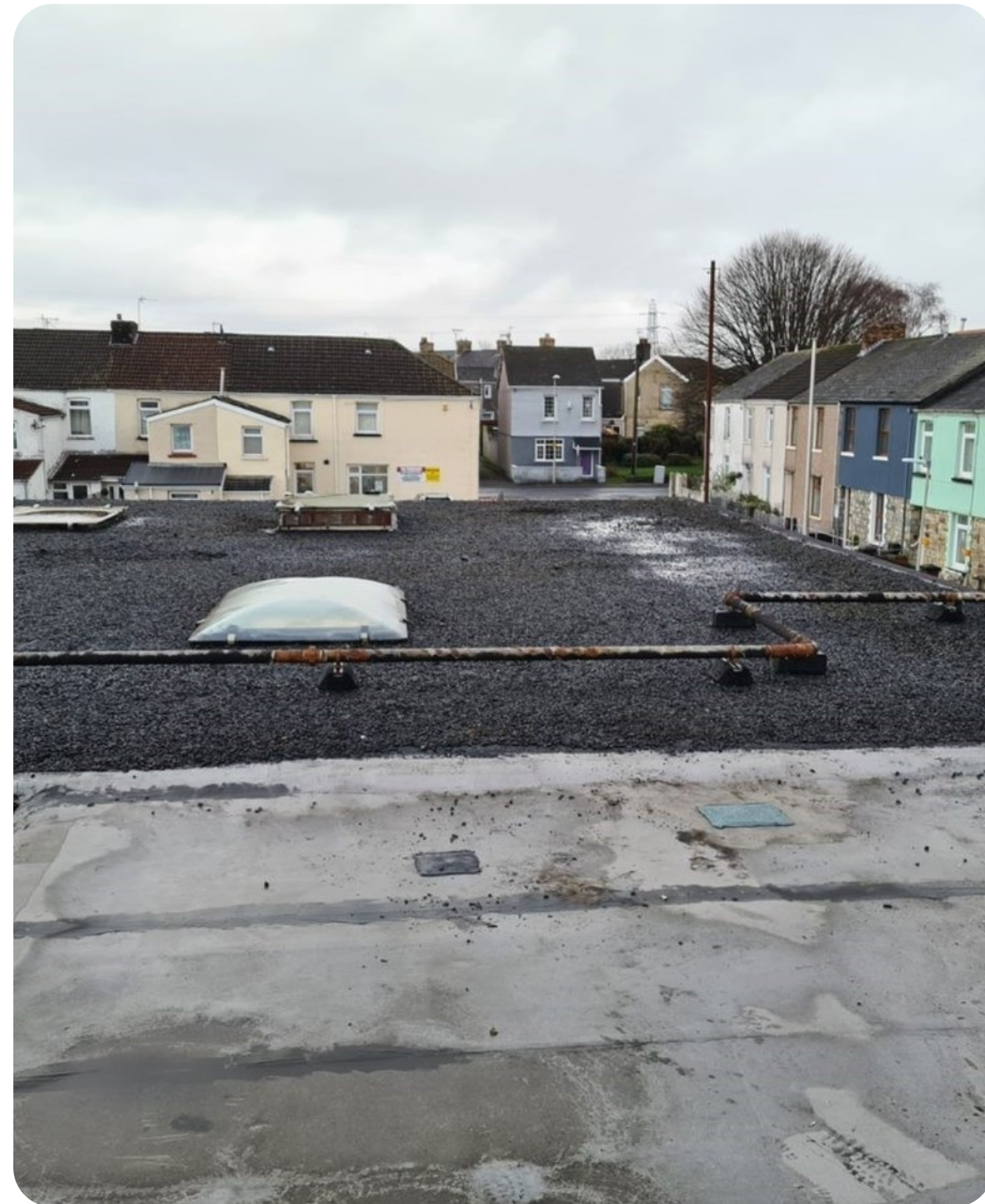
Above Before works

A complete roof refurbishment, including thermal upgrade and full waterproofing of a church centre.