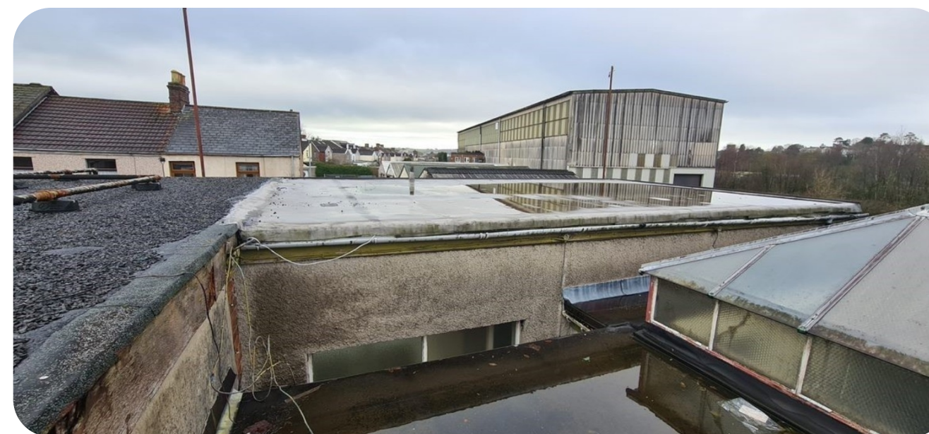
Above Before works

There were also rooflights and roof lanterns that needed to either be replaced or removed and boarded over, a live gas pipe which required lifting to accommodate the new roofing system, and various redundant SVP's and chimneys. Some sections were partially stripped back and overlaid, and others were stripped back fully to the deck ready for the new waterproofing system.