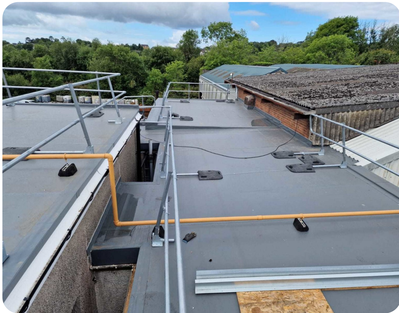
Above After works

Axter carried out in depth surveys and took various core samples to determine the existing build ups of each roof area. It was identified that remedial works were needed to stop water ingress, thermally upgrade the roof, remove standing water, and remove certain rooflights. Two out of the three areas had redundant and dated rooflights / roof lanterns. There was also an active gas pipe laid across the main roof area which had to be taken into consideration when specifying works.